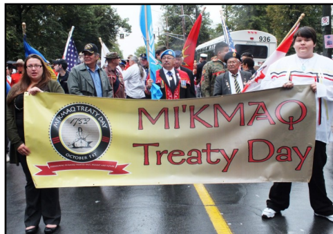
Above: Prize winners display the Treaty Day banner before the parade begins.