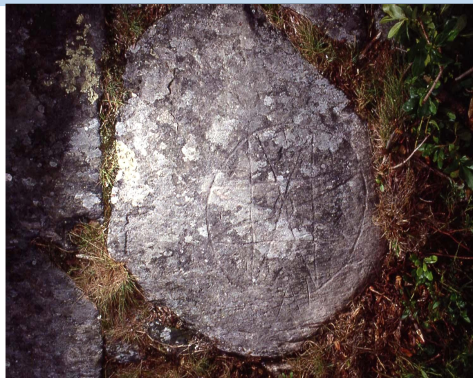
Mi'kmaw petroglyphs