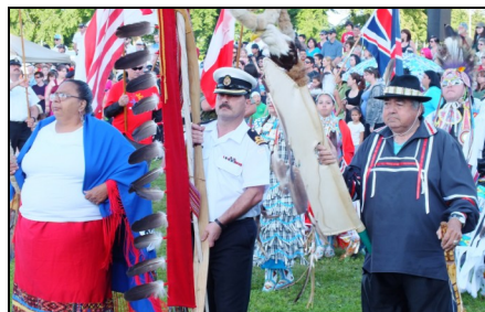
(Above) Grand Entry of Mawiomi 2011.

Mawiomi 2011: Halifax International Pow-Wow partners included: The Mi'kmaq • Nova Scotia • Canada Tripartite Forum, The Province of Nova Scotia, Halifax Regional Municipality, Mi'kmaq Association for Cultural Studies and The Union of Nova Scotia Indians. More information can be found at www.halifaxpowwow.com .