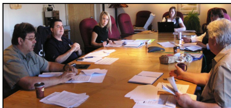
(Above) Project Fund Committee members discuss submitted funding proposals.