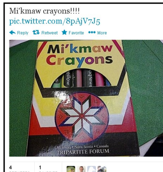
(Above) The original photo 'Tweet' of the Mi'kmaw Crayons from Twitter.

On Facebook, the trend continued with Mi'kmaw community members who took keen interest in the Mi'kmaw crayons.