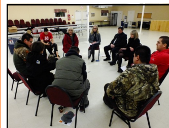
(Above) Community members attend the public discussion in Millbrook.