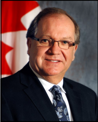
(Above) Bernard Valcourt, Minister of Aboriginal Affairs and Northern Development.