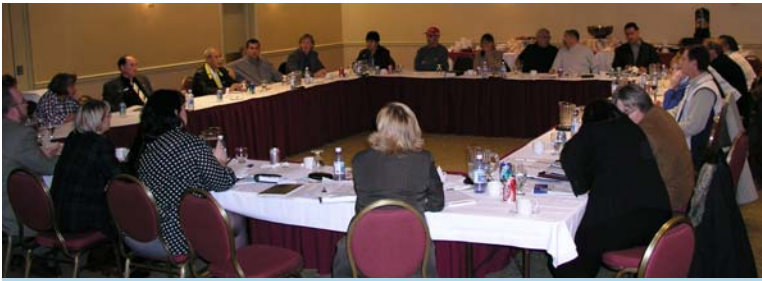
(above) The officials committee discuss Mi'kmaq issues and concerns in Halifax on November 13th.