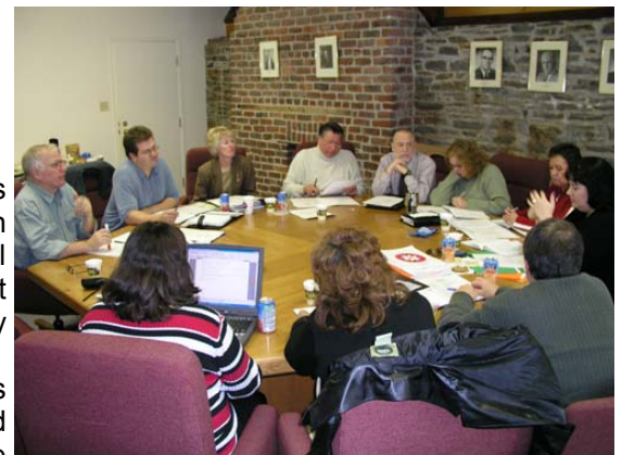
Above: culture & heritage working committee at a meeting in Halifax on November 27